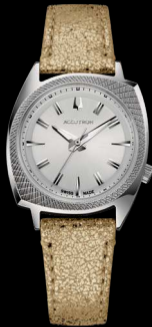
Additional straps included with the watch