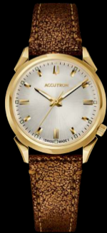
Additional straps included with the watch