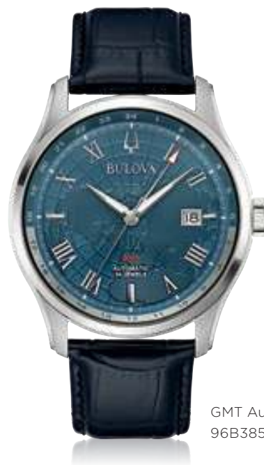
GMT Automatic 96B385

The Bulova Wilton GMT Automatic is the ultimate timepiece for avid travelers and fine watch enthusiasts who appreciate an elegant timepiece with the sophisticated design of a dual time movement.